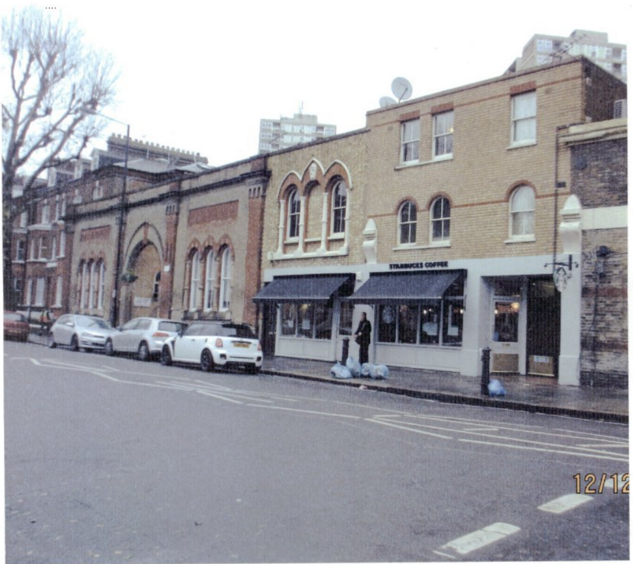
168-170 RANDOLPH AVENUE, W9